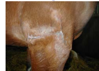
Fig 5: 28/03/04