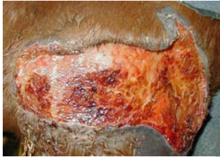
Fig 1: 15/12/03

The ECB equine Spa has a unique design that enables a hose to be attached and cold water therapy performed in the spa to re-circulate the spa solution. Injuries above the thoracic cavity can then receive cold water therapy.