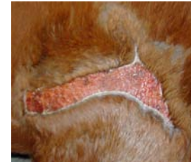
Fig 4: 20/01/04

Considerable closure of wound and hair growth